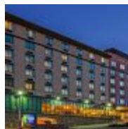
Holiday Inn Express Fort Worth Downtown 1111 W Lancaster Ave Fort Worth, TX 76102