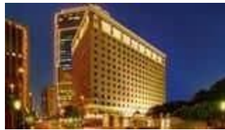
Hilton Downtown Fort Worth 815 Main St Ft Worth, TX 76102