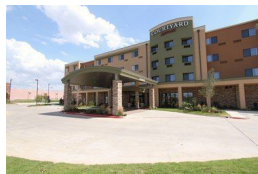
Courtyard Marriott West at CityView 6400 Overton Ridge Blvd Fort Worth, TX 76132

Rooms from the above hotels and from other hotels can be booked through the following link: https://app.roomroster.com/events/5267/hotels?nav=hidden